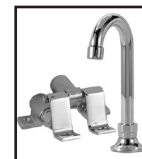
FOF-D Foot-operated faucet

⚠ WARNING: The plastic wet waste strainer accessory can expose you to chemicals including Bisphenol A (BPA), which is known to the State of California to cause birth defects or other reproductive harm. For more information, go to www.P65Warnings.ca.gov . Warning applies to State of California only. Part #03000483