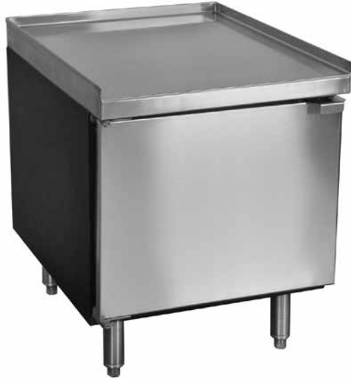
MS20 with optional legs