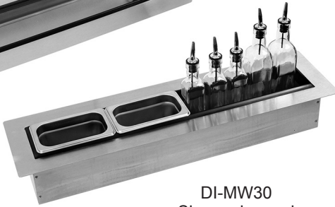
DI-MW30 Shown dressed (1/9th pans and bottles not included)