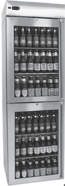
with standard coated-wire shelves