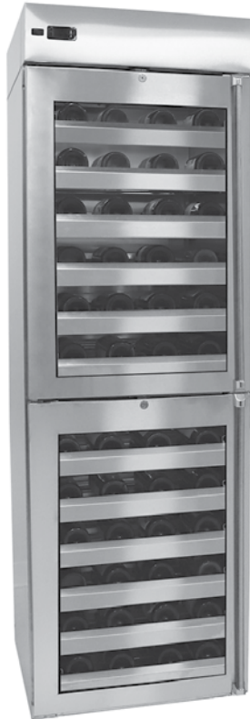
with optional pull-out wine shelves