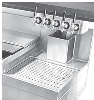
UC-5-SSR Shown installed under bar top with BDB-18 beer drainer