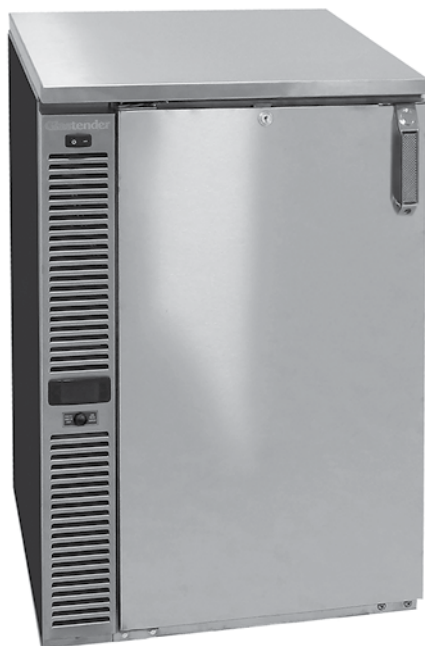
F1SL24 with compressor left, stainless door and top