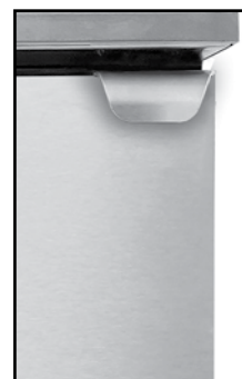
Pull tab handle