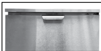
Drawer pull-tab handle