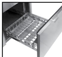
Optional drawers include adjustable divider walls