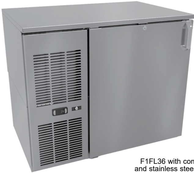
F1FL36 with compressor left and stainless steel door and top