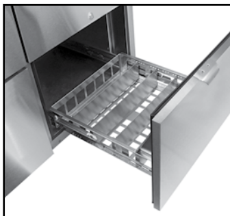
Optional drawers include adjustable divider walls