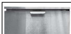
Drawer pull-tab handle