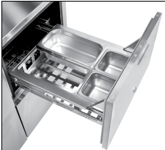
DIP-18 shown Pans not included