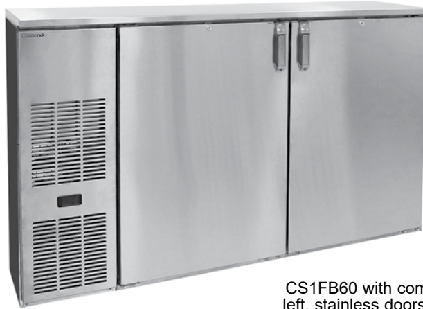
CS1FB60 with compressor left, stainless doors and top