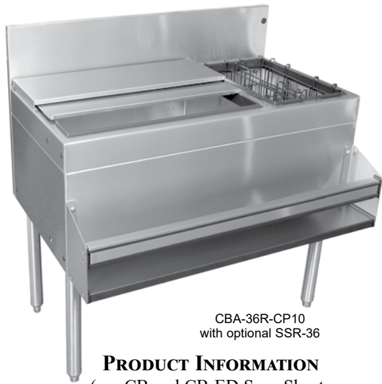
CBA-36R-CP10 with optional SSR-36

PRODUCT INFORMATION (see CB and CB-ED Spec Sheets for complete details)