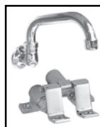
FOF-B Optional foot-operated faucet (C-MFT-8 excluded)