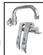
KOF-B Optional knee-operated faucet (C-MFT-8 excluded)