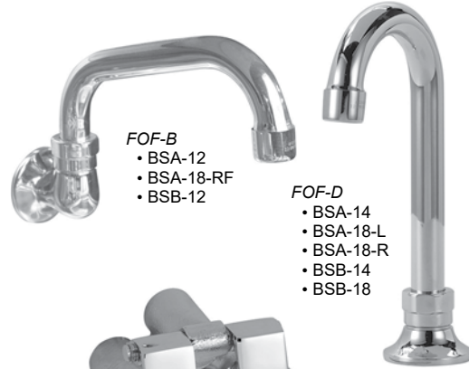
Optional foot-operated faucets