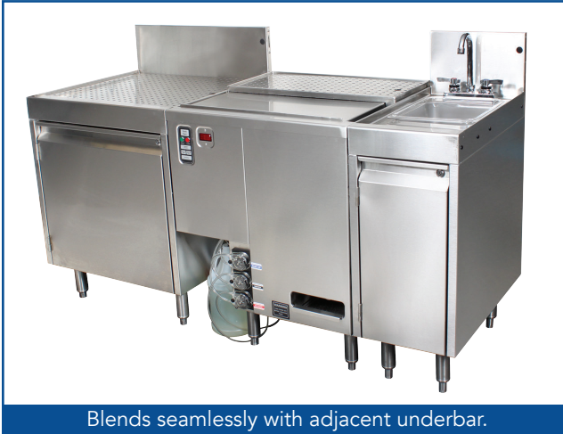
Blends seamlessly with adjacent underbar.

As long as a bartender is washing glassware by hand, they are unable to fulfill customer drink orders. The GW24 rotary glasswasher features a cool rinse cycle so glassware can be moved back into the workflow as quickly and efficiently as possible.