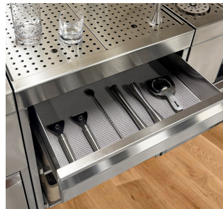
Built-in drawers offer storage for mixology tools.