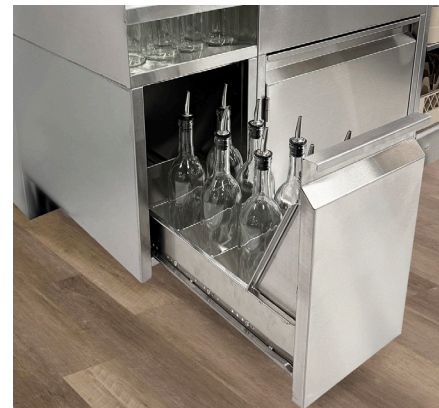
Pull-out drawers add bottle storage underneath liquor display units.

Improved storage helps promote an efficient workflow for staff and streamlined customer service.