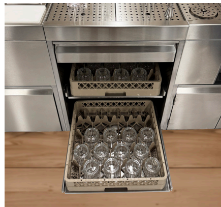
Pull-out racks for quick access to clean glassware.