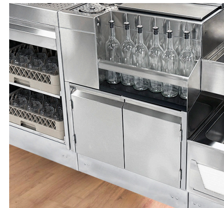
Cabinet bases offer storage for supplies and equipment.