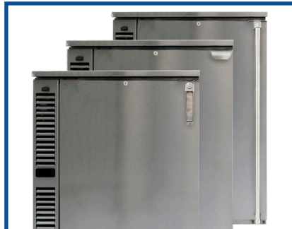
Signature, Pull-Tab, or Tube Handles