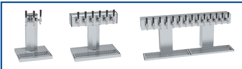
Column, Tee, or Bridge Tower