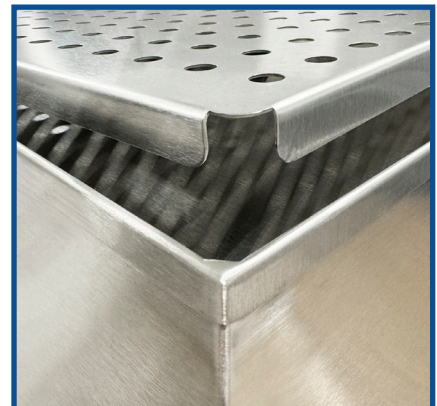
Elevated, perforated insert offers shorter dry time.